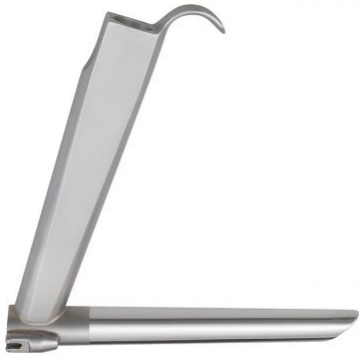
fig. 5; Ø 16mm; 172mm